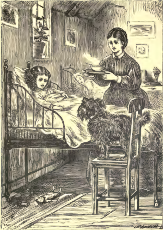
Poodle's going the Round.